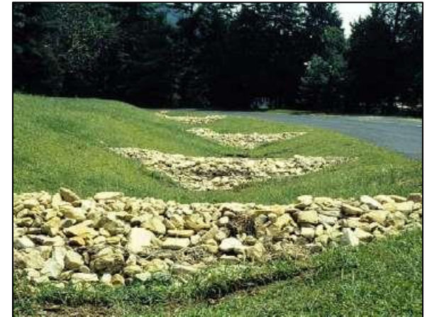
Good installation of rock silt checks maintained until the project is completely stabilized. Now that the site is stabilized, checks are ready for removal.