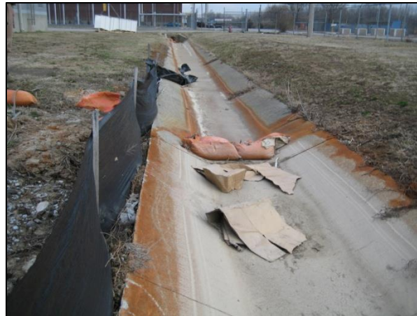
Poor installation of stone-filled bags to serve as check dam. Tied end of bag should be on the downstream end and the center should be lower than the sides.