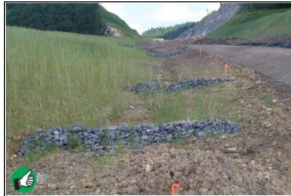
Good installation of low profile temporary rock silt checks. Remember to tie sides of silt check to upper banks. Middle section should be lower. Clean out sediment as it accumulates.