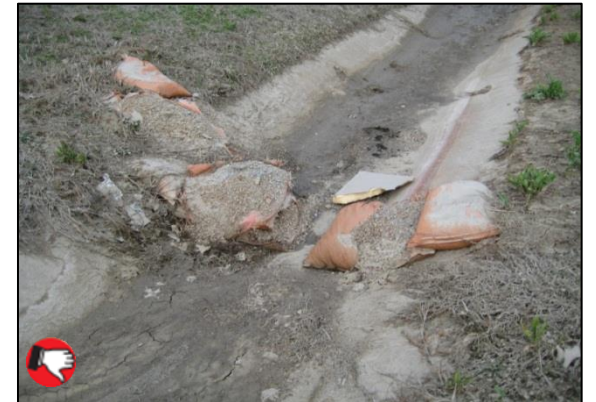
Routine inspections and maintenance are not taking place. Sediment buildup should be cleared and missing bags replaced.